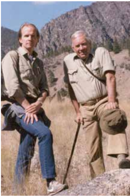
Figure 3 – Vance Martin and Ian Player traveled together around the world meeting people and exploring wilderness and its protection. Here they are in the River of No Return Wilderness in Idaho, United States.

WILD on behalf of the Wilderness Network and many other collaborators in support of Ian's vision, have helped a growing number of nations (now 11) create national de jure designation of protected wilderness, and many more nations creating de facto wilderness protection through area planning and policies.