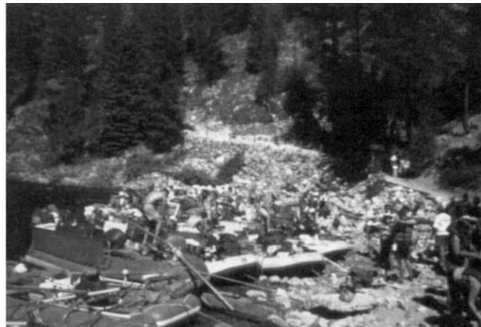
Commercial clients were more opposed to reducing the allowable number of people per float party.

measured on a five-point scale ranging from "strongly support" to "strongly oppose" with both a neutral point on the scale for respondents who could not decide their support and a column labeled "no opinion" for those who either did not care or had insufficient knowledge to judge how much they supported proposed actions. Visitors were asked to report how much certain things influenced their river trip by rating them as being "no problem at all," "a small problem," "a moderate problem," or "a big problem." The items evaluated included potential congestion/crowding problems and human-caused resource impact problems.