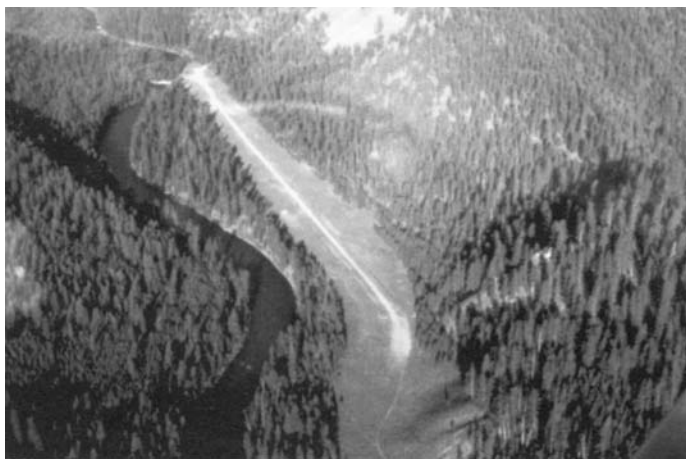
Indian Creek Airstrip, Frank Church-River of No Return Wilderness, Idaho.

To apply this process to airstrip management, the legislative history of both TWA and the legislation establishing a particular wilderness must be examined. Two out of three of the wildernesses in the coterminous states that contain aircraft landing strips, the Frank Church-River of No Return Wilderness (FC-RONRW) and the Great Bear Wilderness, were not designated by TWA.