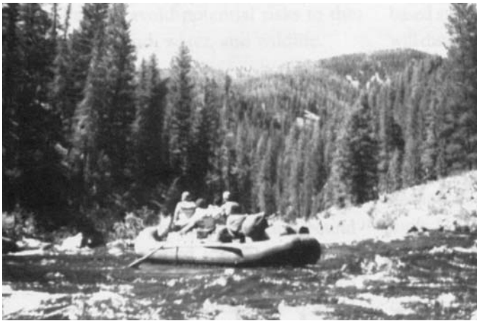
A "wild" river is generally inaccessible except by trail, with watersheds or shorelines essentially primitive.

is approximately split in half. Private use is limited through a lottery system with chances to receive a permit upon application estimated at one in 23. Commercial clients do not apply for a limited number of permits. Outfitters receive an allocation of launches, constrained only by limits on group sizes, equipment, and adequate camping locations.