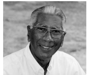
Article author Lyn de Alwis.

In direct contrast to this was the kind of sanctuary that the British declared in 1909. They were "game" sanctuaries in which game was protected for sportsmen to kill! Actually, by the twelfth century Sri Lanka had reached the zenith of its prosperity as an agricultural nation. It had been referred to as "the granary of the East." We must also remember that by this time its population, though not as high as 20 million as some historians try to make out, was "exploding" in the face of prosperity. To have succeeded in transforming natural ecosystems into a comprehensive agrosystem meant that the people of Sri Lanka was practicing stringent conservation methods, especially those of water and of soil. It was another clever King—Prarkrama Bahu—who reigned in 1153 A.D. who directed