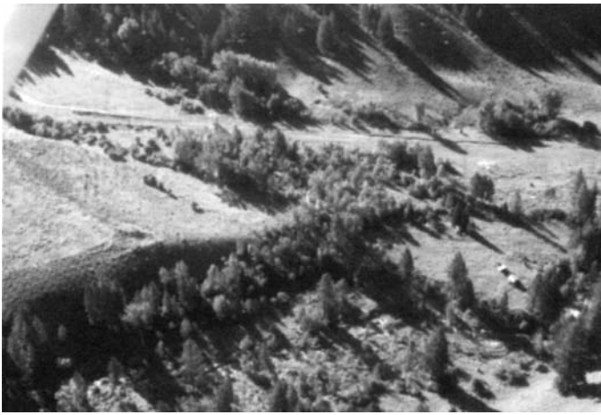
Cabin Creek Airstrip, Frank Church-River of No Return Wilderness, Idaho.

agency's ability to close airstrips on the FC-RONRW. In doing so, Congress demonstrated that it could reduce the agency's management discretion if it desired. At the same time, Congress did not specifically limit the agency's discretionary ability to restrict use levels. By expressly restricting closures but not restricting other management discretion, Congress indicates that only the ability to close airstrips is limited.