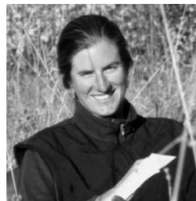
Article author Shannon S. Meyer.

Three wilderness areas outside of Alaska have active airstrips on federal land, with a total of 16 airstrips in Idaho and Montana. These airstrips are used by agency personnel, private pilots, and outfitters for myriad purposes, including hunting, fishing, boating, wilderness administration, and scientific research. In addition, "touchdowns," where pilots land on backcountry airstrips for the challenge of the landing rather than for access to the wilderness, are popular among some pilots.