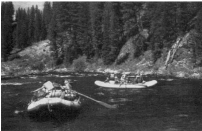
In this study, visitors completed a survey in stages as they floated down the rivers.

Watson and Cronn (1994) reported that wilderness visitors with a more extensive history of visiting a particular wilderness will more likely notice