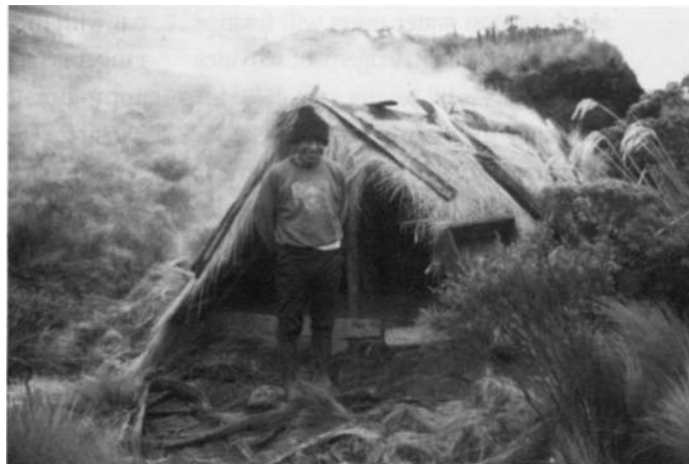
One of the community park rangers from Oyacachi at his post in the paramo.

In late 1998 the management team undertook a series of interviews with protected area staff, community rangers, and community members to determine what have been the best and worst experiences, and how the programs could be improved. This was the first objective evaluation of the program by the management team. The management team, after reviewing the results of a 1997 threats analysis, also determined the most important communities for locating community rangers. By analyzing threats to the reserves, identifying community/park conflicts, and