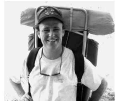
Article author Bill Hendricks.

One means of distinguishing between the central and peripheral routes of persuasion is within the content of a message. In general, a message that emphasizes questions results in a higher level of central route processing than a message that relies on assertions (Petty et al. 1992). For example, asking an individual why dishes should not be washed in a stream may result in a higher degree of central route processing than telling the person that they should not wash dishes in a stream.