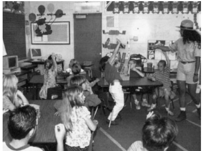
“Asking” message format.

There were 302 boys (52.6%) and 270 girls (47.0%) who participated in the study (gender was not provided for two students). Roles in the skit (frog, tree, rocks, flower, sign, and snake) were played by 192 randomly selected students (33.4%). An analysis was conducted for the full repeated measures model and for each of the potential behavioral intentions. Significant differences between pre-test and post-test scores were present for levels of all factors (see Table 1). The full model indi-