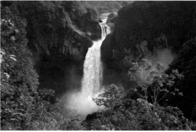
San Rafael Waterfall, Cayambe-Coca Ecological Reserve, Ecuador.

and other international conservation organizations, hopes to link these two protected areas with Cotopaxi, Gran Sumanco, and Napo-Galeras National Parks. When joined together these protected areas will form a reserve that is nearly 2.5 million acres in size (one million hectares) and will include three ecoregions of highest priority for conservation: Northern Andean paramo, Eastern Cordillera Real montane forests and Napo moist forest (Dinerstein et al. 1995). The principal threats to the protected areas are road construction, dam construction to generate hydroelectric power and channel water for irrigation and drinking water, colonization, burning of the paramo grasslands, and the clearing of land for agriculture and cattle production.