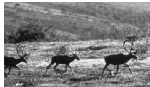
Barren ground caribou of the porcupine herd filter through Vuntut National Park by the thousands en route to their wintering grounds. The pervasive spiritual and cultural connections between Vuntut Gwitchin and porcupine caribou will endure only if the herd is protected against threats to their natural existence.

The VGFA ensures Vuntut Gwitchin involvement in park design, tourism